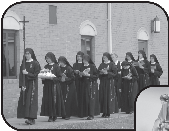
Corpus Christi & May Crowning Processions